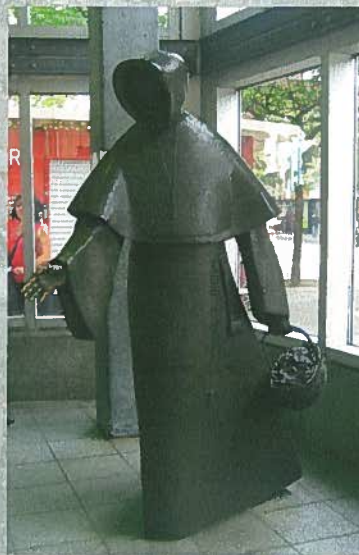
Metro Station - Asile