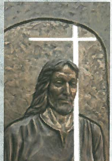
The Holy Door*

*A Holy Door is a symbol of oneness with the Universal Church. It is also a symbol of convocation, an invitation to persons of good will to enter, whatever their religious denominations