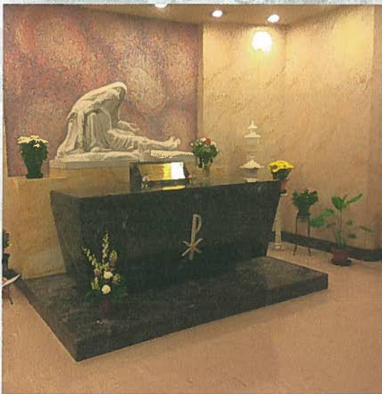
The Tomb of Blessed Emilie Gamelin