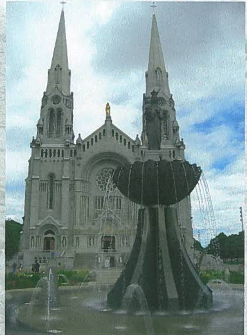
The Basilica of Saint Anne-de-Beaupre, located about 19 miles east of Quebec City has been credited with many miracles curing the sick and disabled.