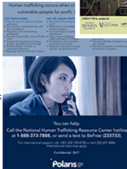
Polaris Poster for Hotel Awareness

"The hospitality industry along with many other sectors finds itself subject to increased media and civil society scrutiny. For a customer facing business it is vitally important that the reputation of UK hotels is maintained both with the general public and national and local government. Ensuring best practice with regard to recruitment and employment of staff and agency workers can help deliver a sustainable future for the industry." ( http://www.staff-wanted.org/ )