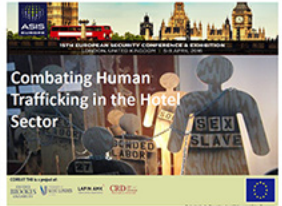
European Training Module for Hotel Awareness Project

( http://polarisproject.org/sites/default/files/Polaris-Flyer.pdf )