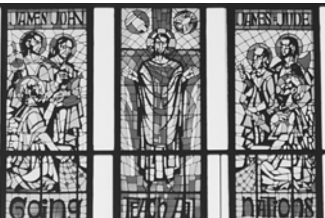
This photo shows three of the nine large, 7-foot-high stained glass windows in the chapel's choir loft that depict Christ and the 12 apostles.

A host of annual campus events offer great opportunities to visit the University of Great Falls. Those events include Founder's Day (Sept. 8); Mass of the Holy Spirit (September); Homecoming (this year, in January); Martin Luther King, Jr., Celebration (January); Holy Week & Easter Observance; the pow-wow in Celebration of Sobriety & Diversity (March); and the Baccalaureate & Commencement (December and May). For more information, check out the university's website at www.ugf.edu , or call the university's public information office at (406) 791-5290. ●