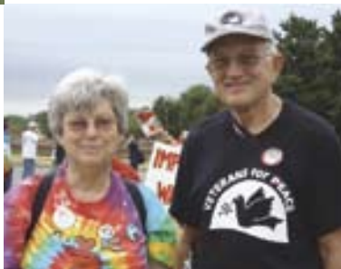
▲ We met lots of people our age and older, too. This older woman came to Washington, D.C., with her husband for her 50th high school reunion, but here they are at the Peace Rally.

was presented by Call for Justice Interfaith Coalition. There were five sessions, the first two dealing with three powerful men: U.S. Secretary of Defense Donald Rumsfeld, former CIA Director George Tenet, and U.S. Attorney General Alberto Gonzales. In this mock trial, the coalition wanted to expose the truth about the use of torture by U.S. agents and the resulting legal, policy and security consequences. They used the broad statements and justifications given by various high-level officials to defend the policies that led to torture. The accusations made by the prosecutor were based on government files and other credible sources.