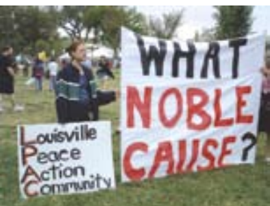
▲ "But where are the young people?" a black male airline attendant asked us as we rode the shuttle at Dulles airport. Well, young people were everywhere at the rally, including youths holding a banner that read, "What Noble Cause?"

Following the service, we decided to go in different directions; she to the training for grassroots lobby day and I to a four-hour session on torture. STOP TORTURE NOW