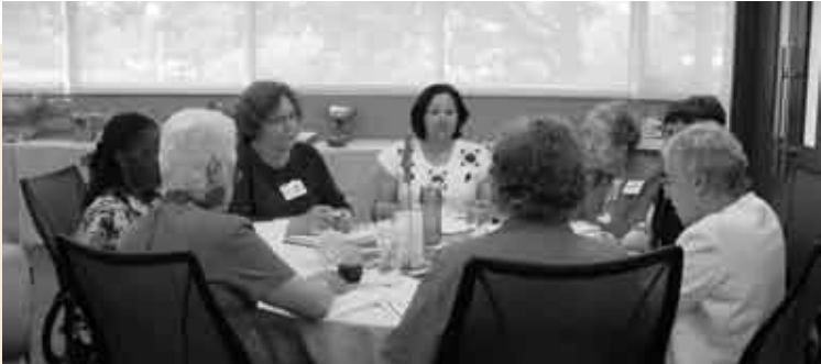
The sharing and listening in table discussions were both intense.