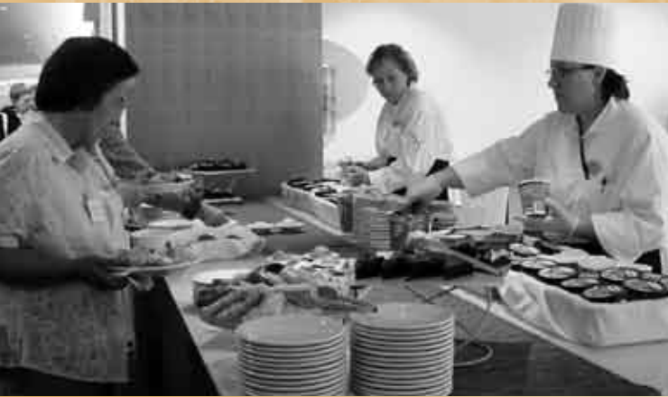
Meals were provided by the kitchen staff of the Providence Café in the Providence Health & Services System Office.