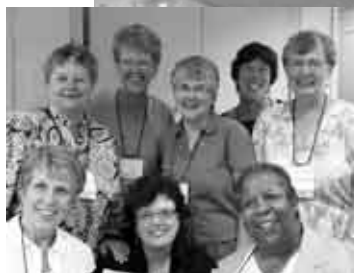
In gatherings large and small, Providence Women reconnected in their reunion at the Providence Health & Services Conference Center. Many classes reunited, including the Class of 1965 (left) and the class of 1959 (below).