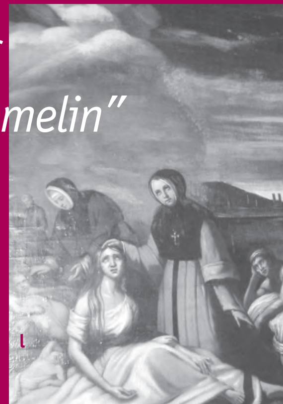
This 12 foot by 15 foot banner of Mother Gamelin, hanging in the Mother House, was hung outside the Vatican at her beatification in 2001.